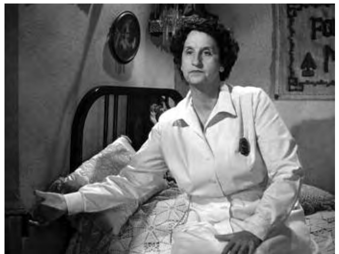
Hope Emerson as the sadistic matron