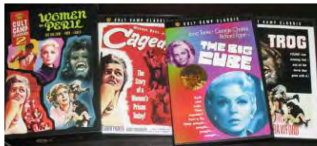
Does Caged really belong in a DVD set of "Cult Camp"?